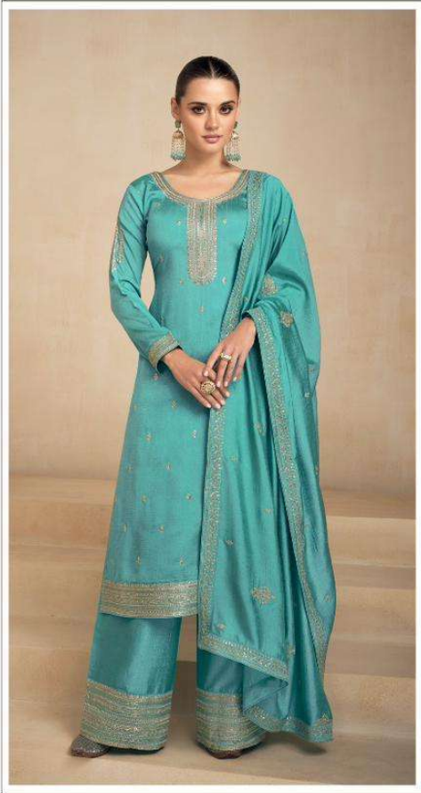
A - 9556