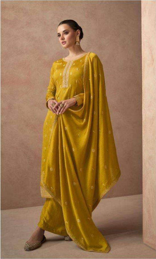
A | - 9569