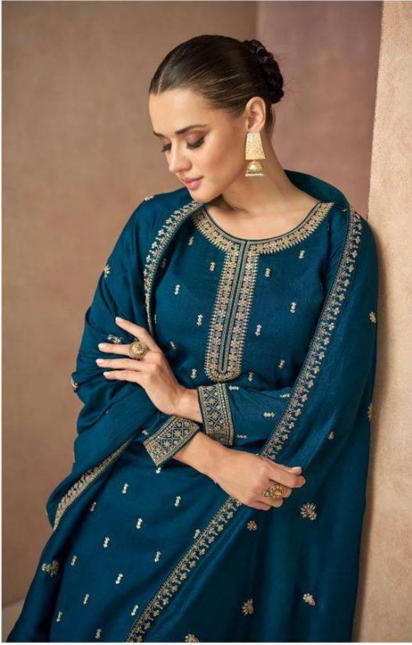
A | - 9565