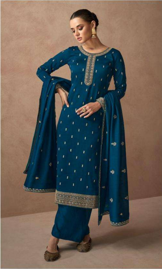
A | - 9565