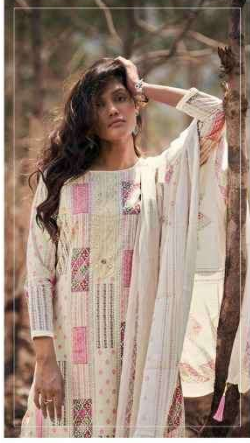
© 2019 Vogue. All rights reserved. No part of this publication may be reproduced without the prior written permission of Condé Nast.