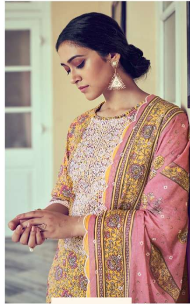
THE ESSENCE OF great Fashion