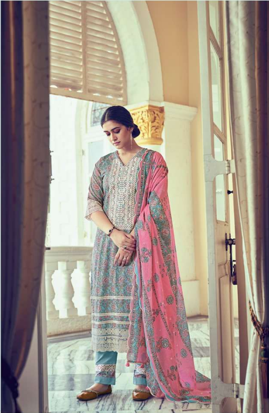
ELEGANT EMBROIDERED contrast ensemble 8206