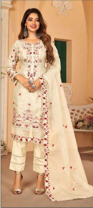
S - 163 A