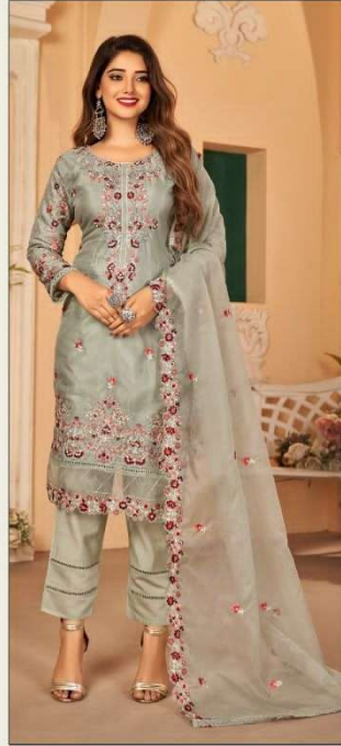
S - 163 B