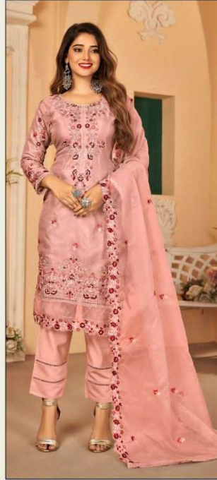
S - 163 C