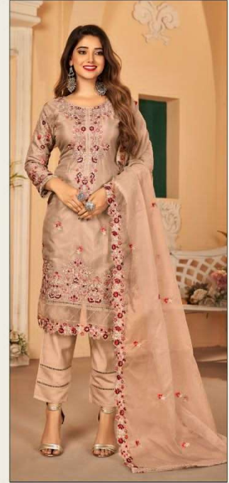
S - 163 D