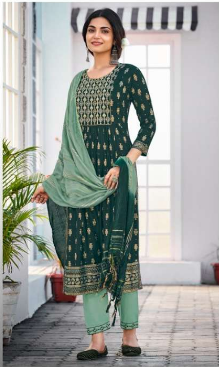
D NO. : 1003