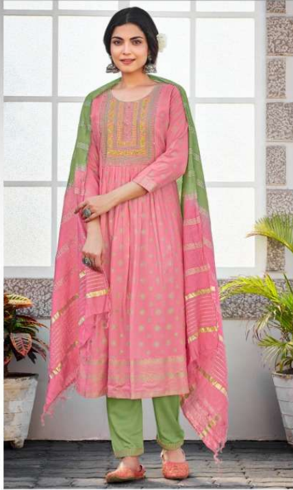
D NO. : 1001