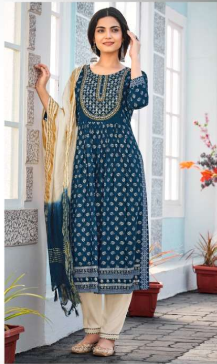
D NO. : 1004