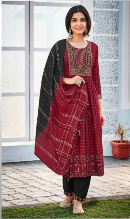
D NO. : 1005