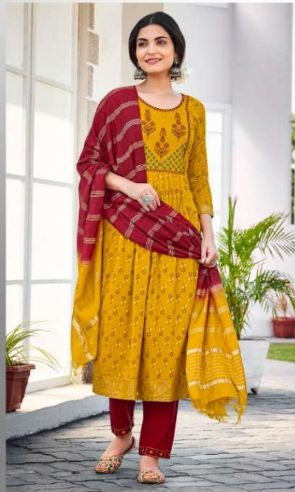
D NO. : 1008