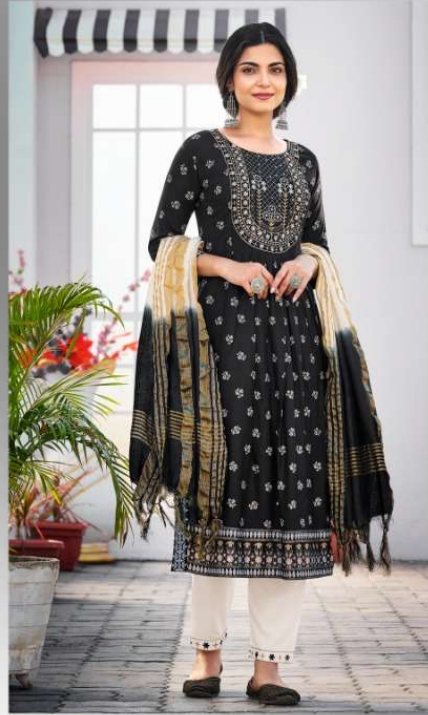
D NO. : 1002