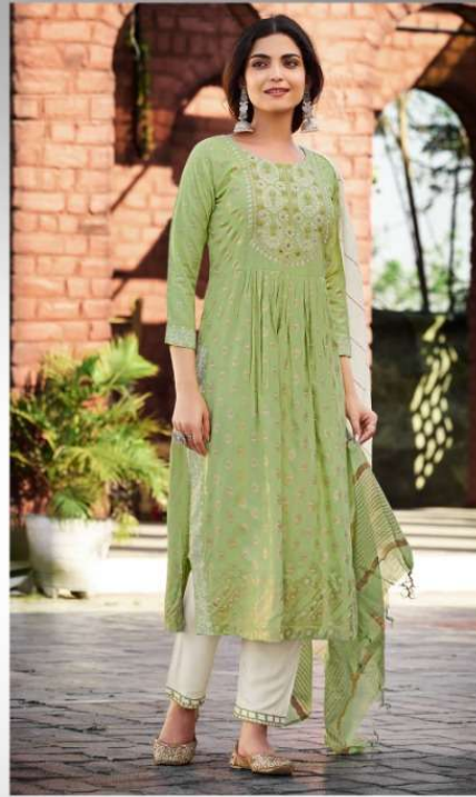
D NO. : 1006