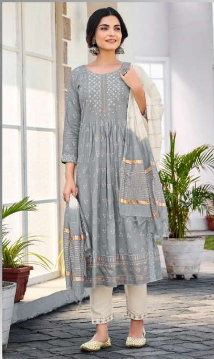
D NO. : 1007