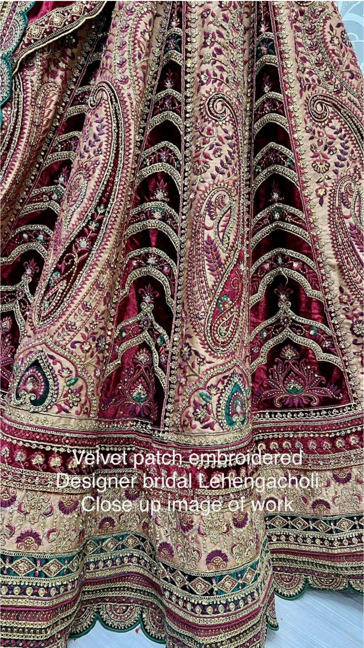
Velvet patch embroidered Designer bridal Lehengacholi Close up image of work