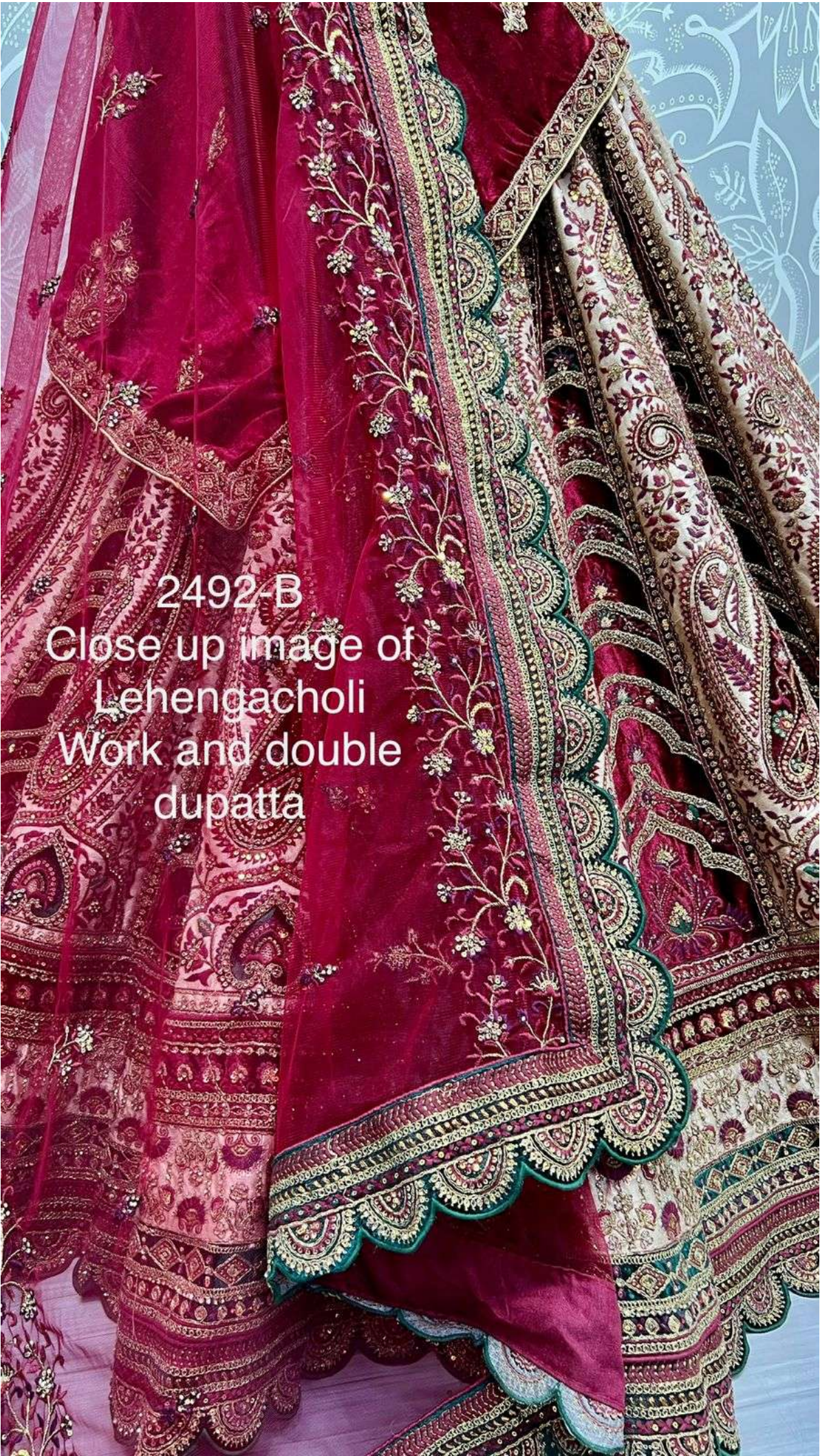
2492-B Close up image of Lehengacholi Work and double dupatta