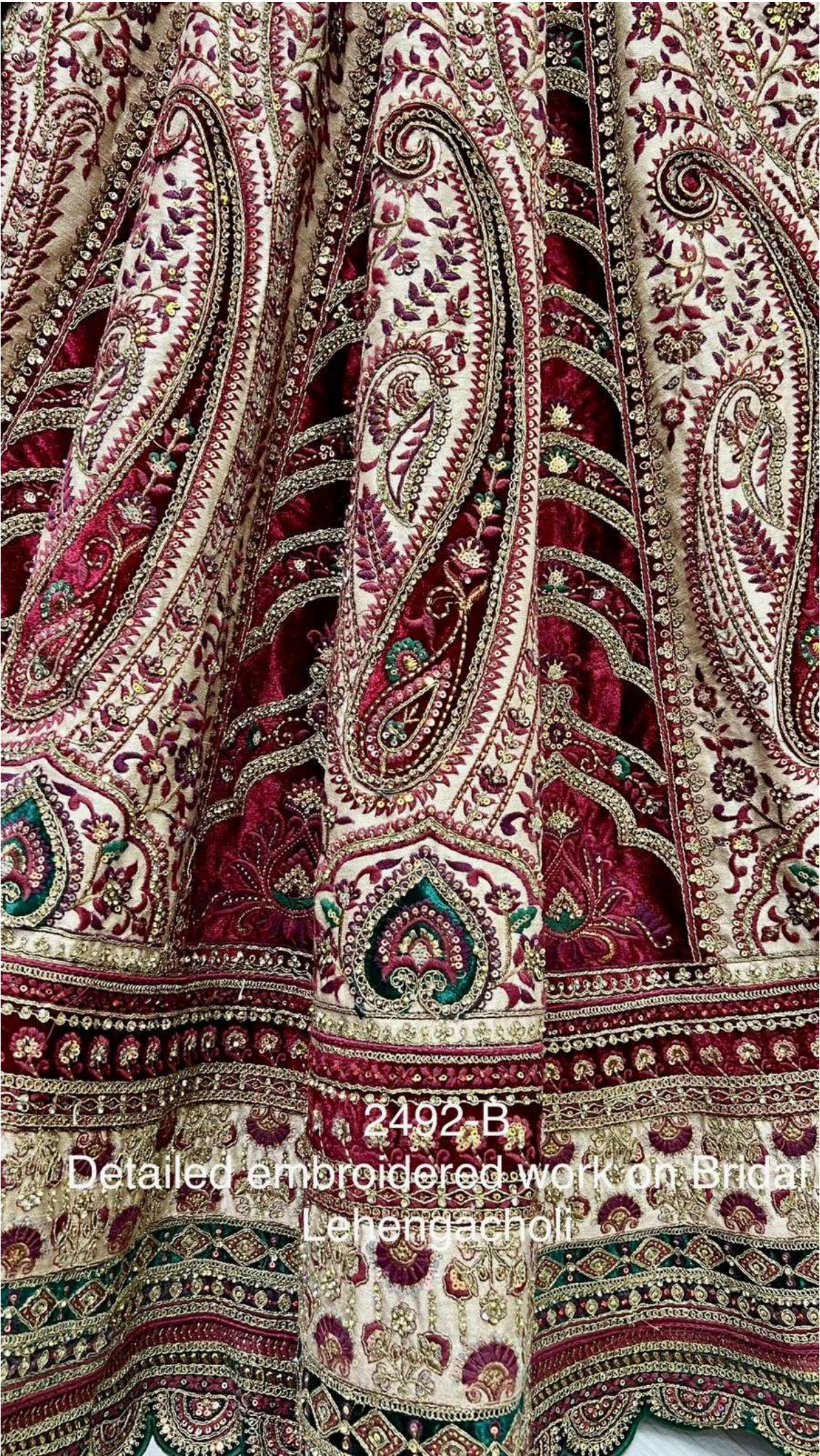
2492-B Detailed embroidered work on Bridal Lehengacholi