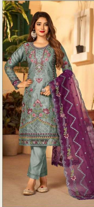
S - 164 B