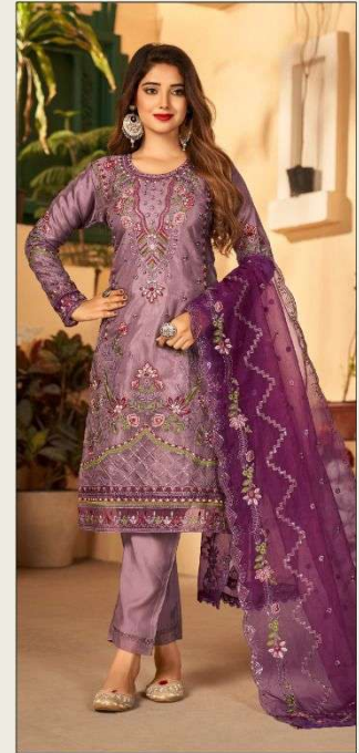
S - 164 D