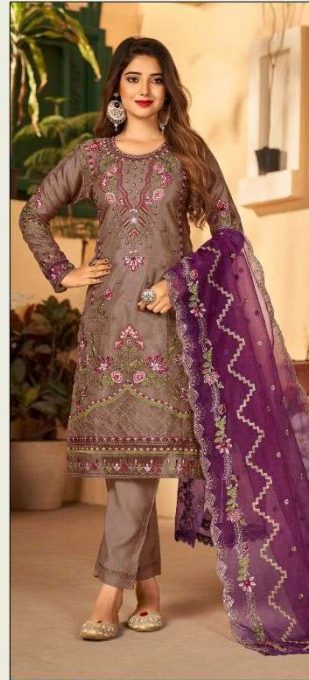
S - 164 C