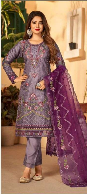
S - 164 A