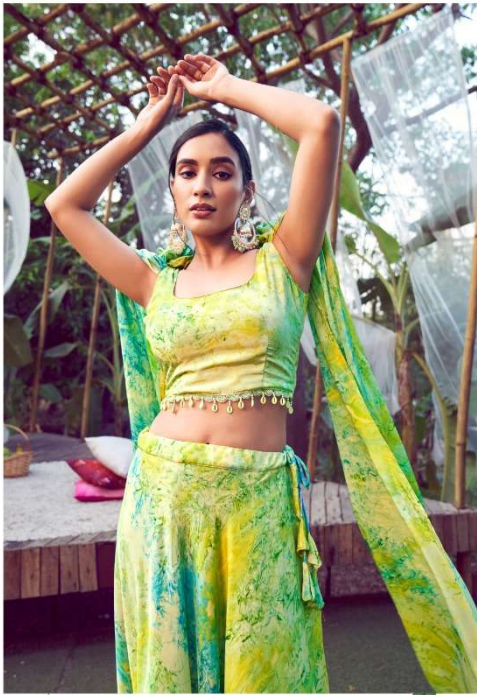
NO.2313 MOST STYLISH WOMEN