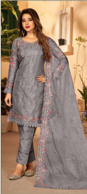
S - 162 A