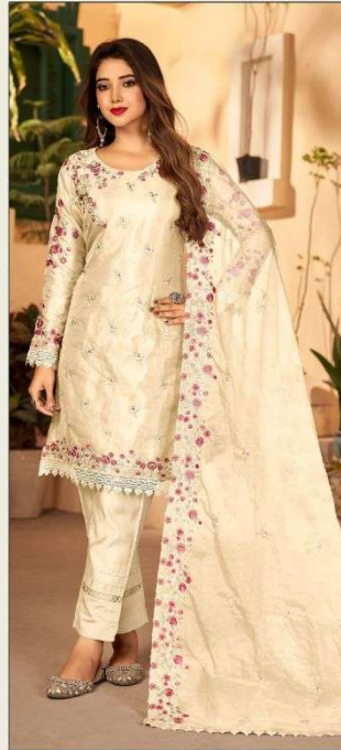
S - 162 B