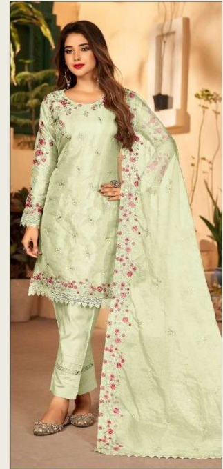
S - 162 D