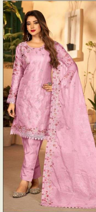
S - 162 C