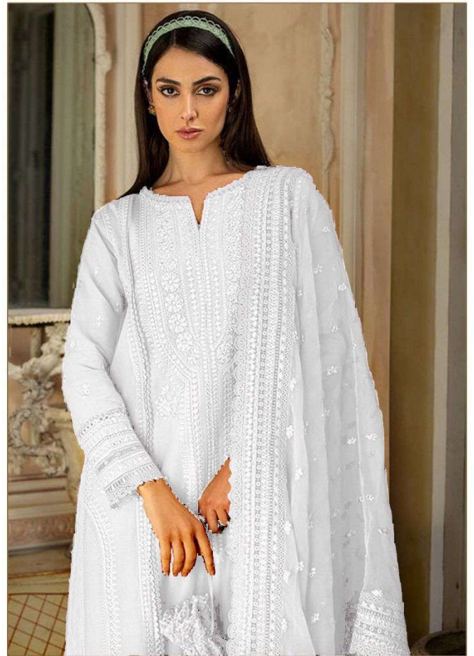
D.NO.146-C TOP:-RAYON COTTON BOTTOM:-PC COTTON DUPATTA:-ORGANZA