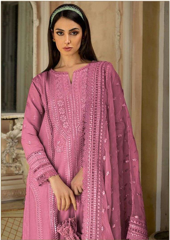
D.NO.146-A TOP:-RAYON COTTON BOTTOM:-PC COTTON DUPATTA:-ORGANZA