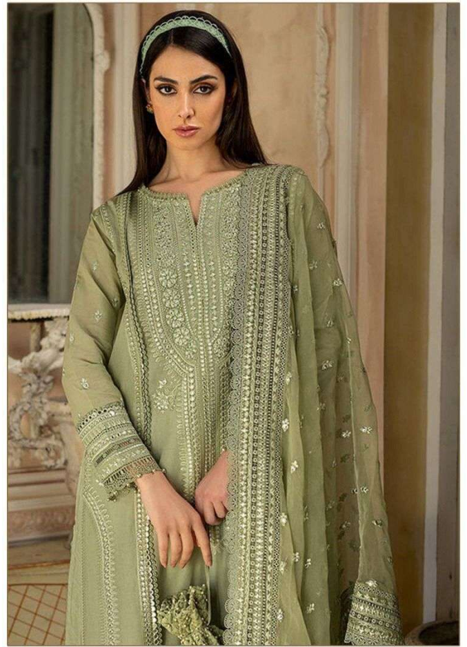
D.NO.146 TOP:-RAYON COTTON BOTTOM:-PC COTTON DUPATTA:-ORGANZA