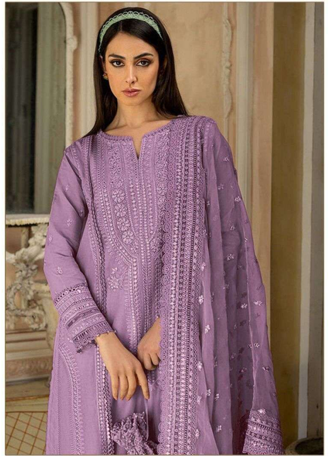
D.NO.146-D TOP:-RAYON COTTON BOTTOM:-PC COTTON DUPATTA:-ORGANZA