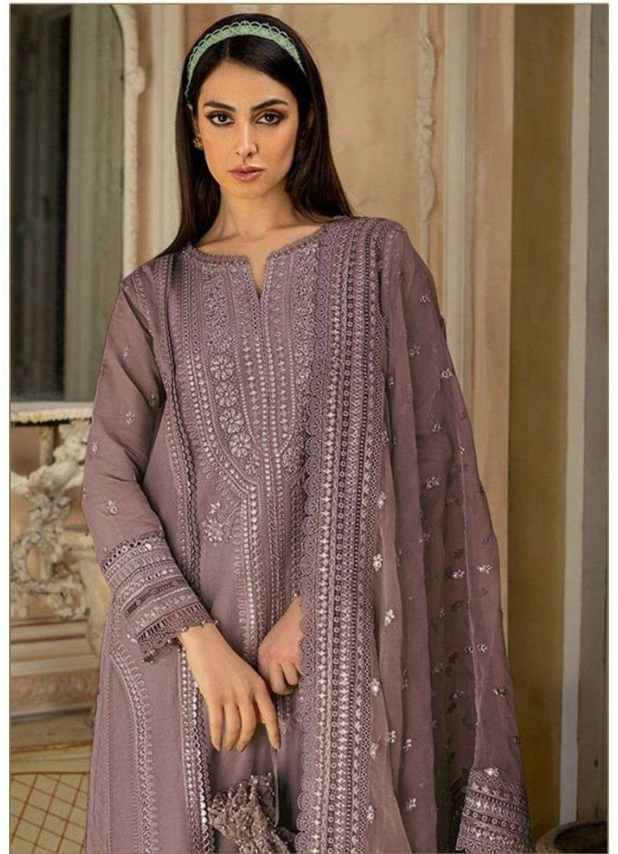
D.NO.146-E TOP:-RAYON COTTON BOTTOM:-PC COTTON DUPATTA:-ORGANZA