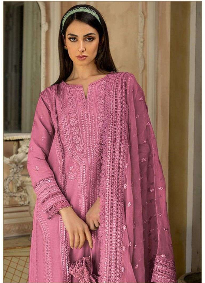
D.NO.146-A TOP:-RAYON COTTON BOTTOM:-PC COTTON DUPATTA:-ORGANZA