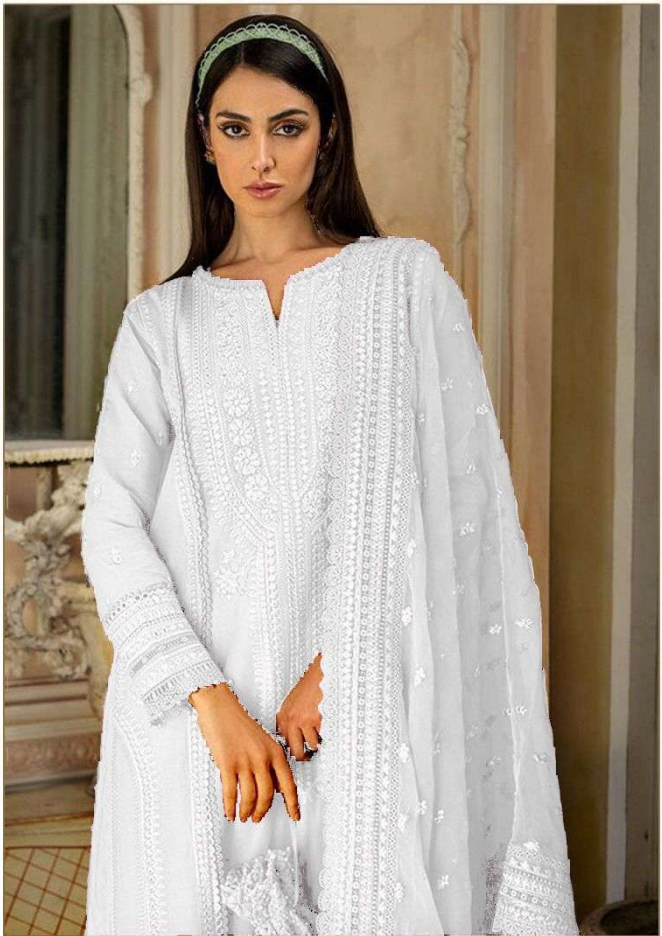
D.NO.146-C TOP:-RAYON COTTON BOTTOM:-PC COTTON DUPATTA:-ORGANZA