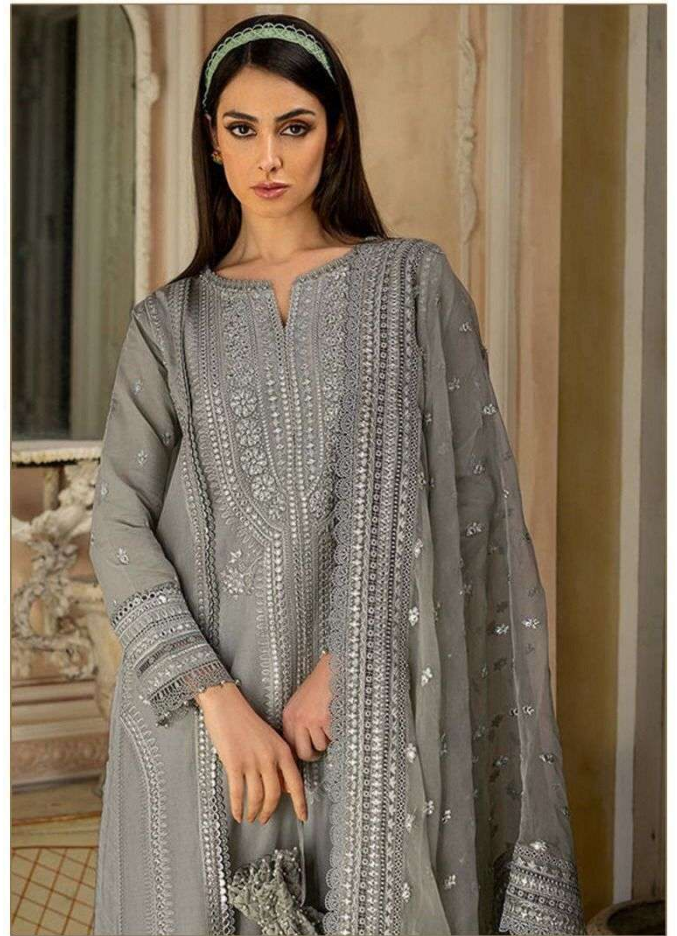
D.NO.146-B TOP:-RAYON COTTON BOTTOM:-PC COTTON DUPATTA:-ORGANZA