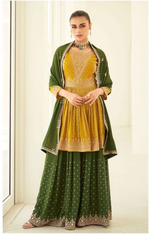
A | - 9661