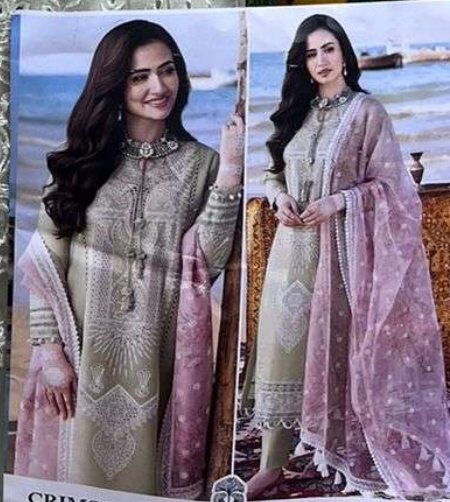
CRIMSON ZAHA D.No. 10191 TOP: Cambic Cotton With Heavy Embroidery Work BOTTOM-INNER: Semi Lawn DUPATTA: Butterfly Net with Heavy Embroidery