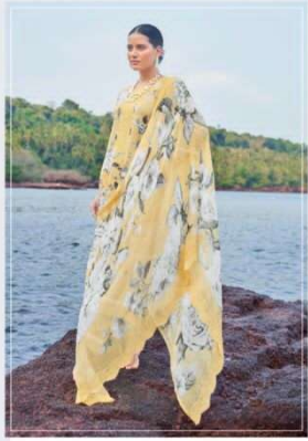
704 ● ● ●