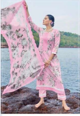
701 ● ● ●