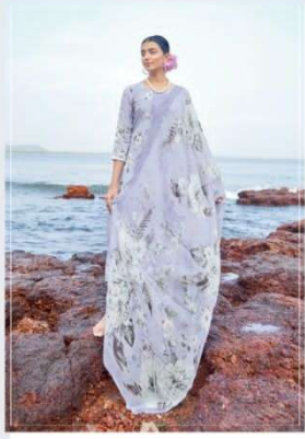
702 ● ● ●