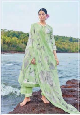
703 ● ● ●