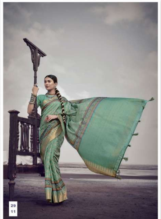
AS SERENE AS THE NATURE