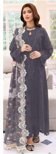
189 E ✻