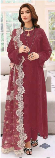
189 B ✻