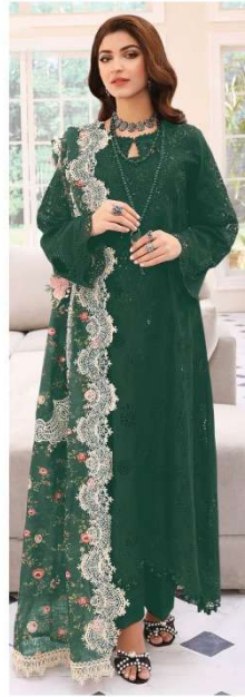
189 D ✻