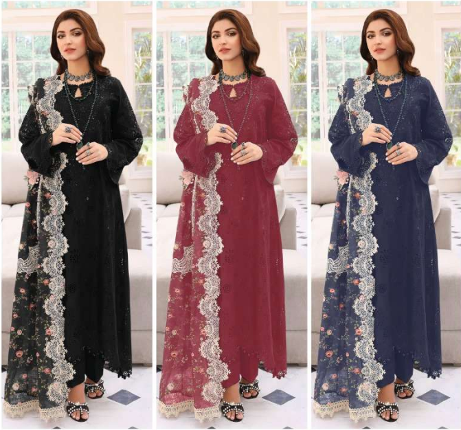
189 A ✻