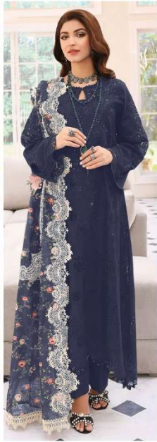
189 C ✻