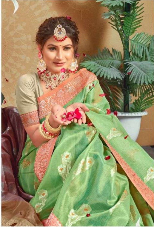
Sarees are like Indian women – so versatile. From business meetings to first nights, from political speeches to red carpets, from college frescoes to Indian kitchens, they truly have many avatars.