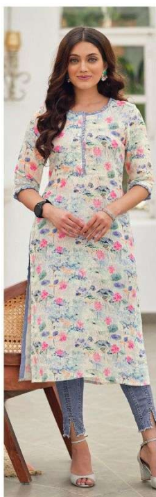
Z - 1152