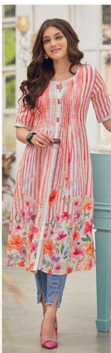
Z - 1153