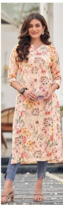
Z - 1154