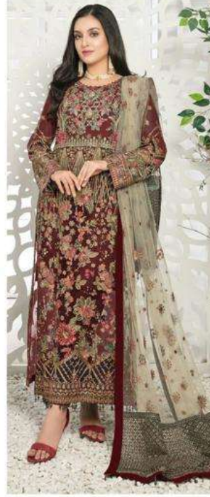
D.NO. - 4002