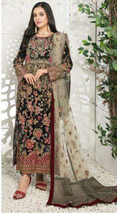
D.NO. - 4001