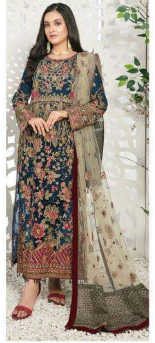
D.NO. - 4003