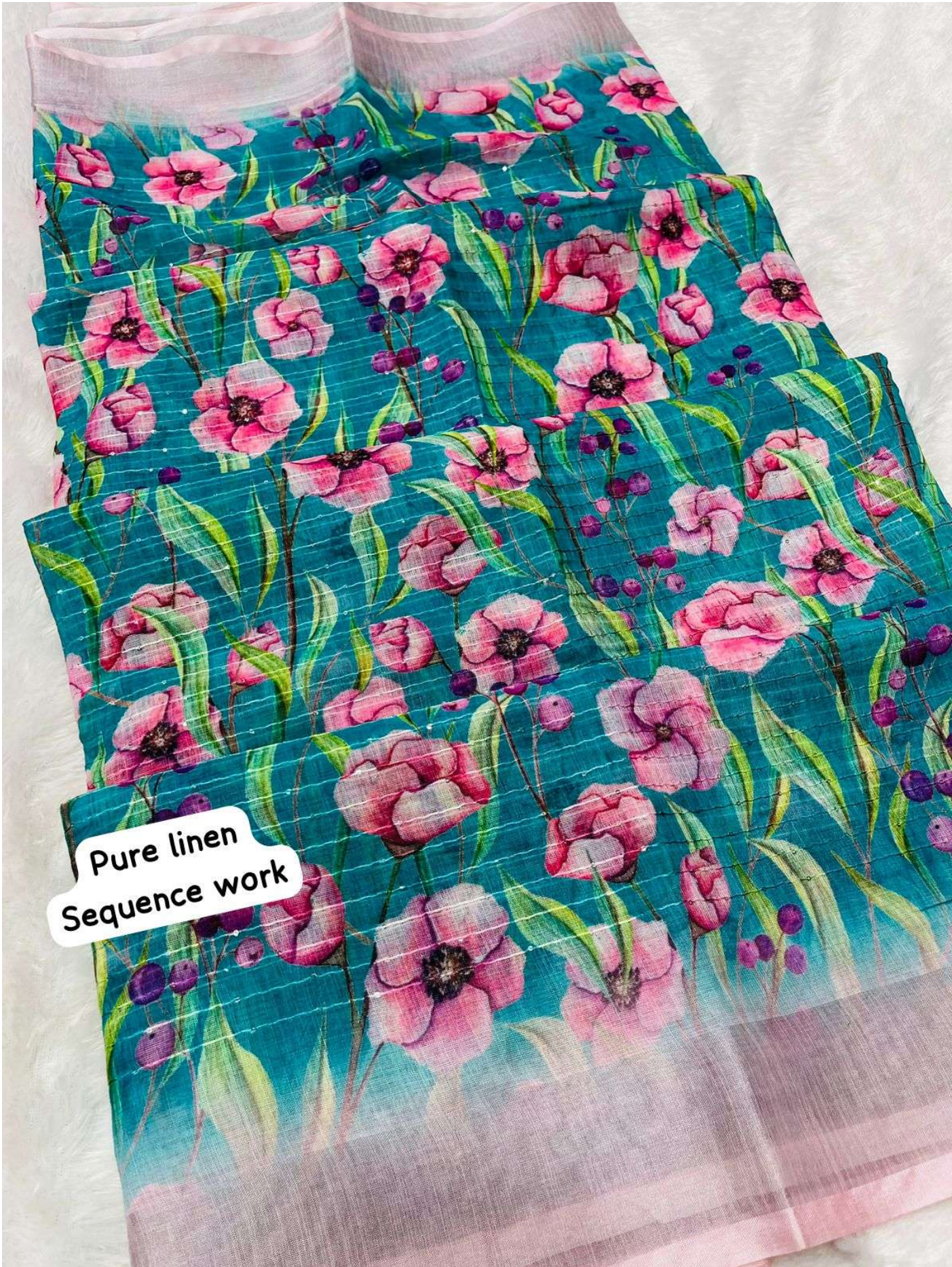
Pure linen Sequence work