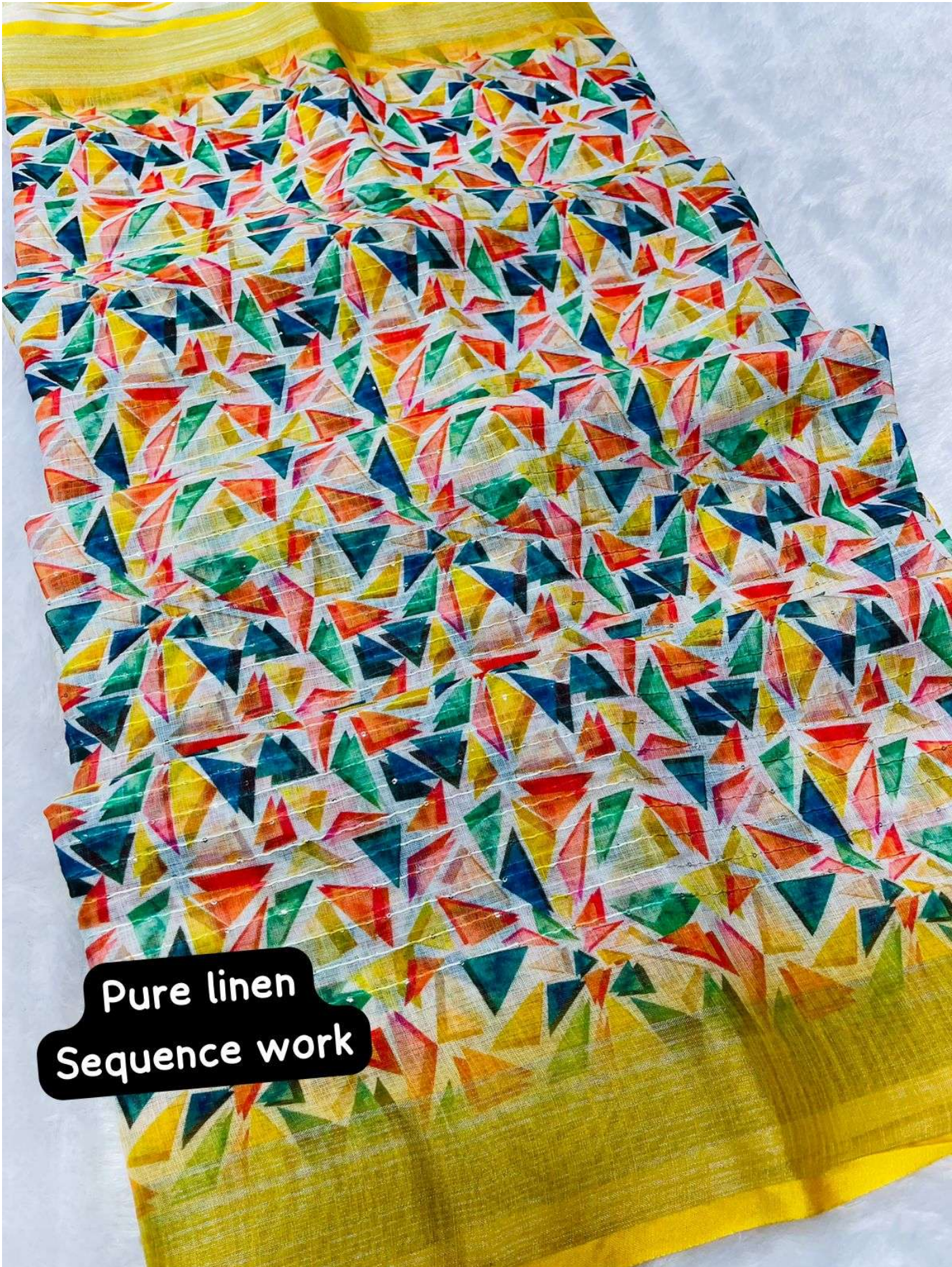
Pure linen Sequence work