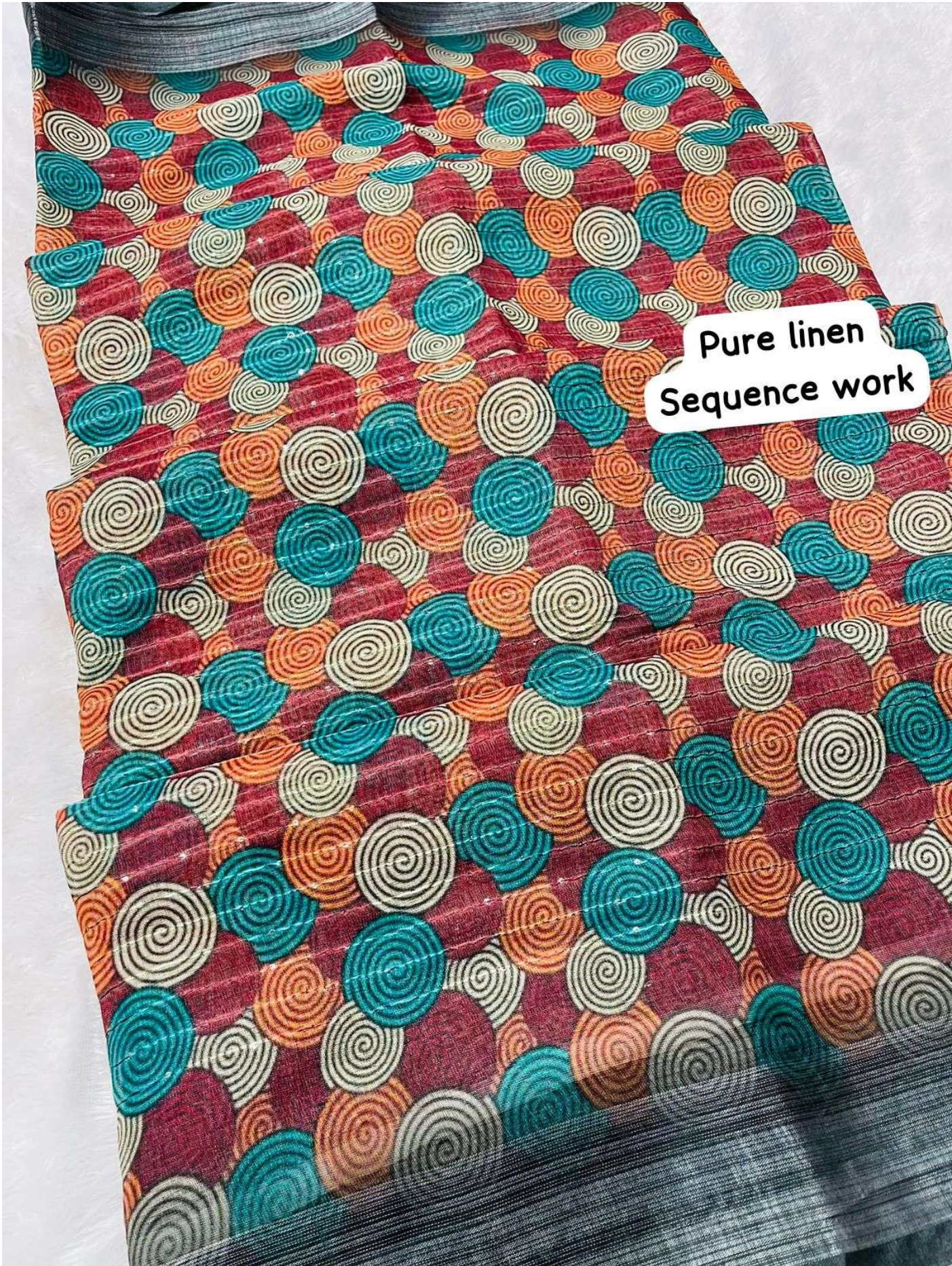
Pure linen Sequence work