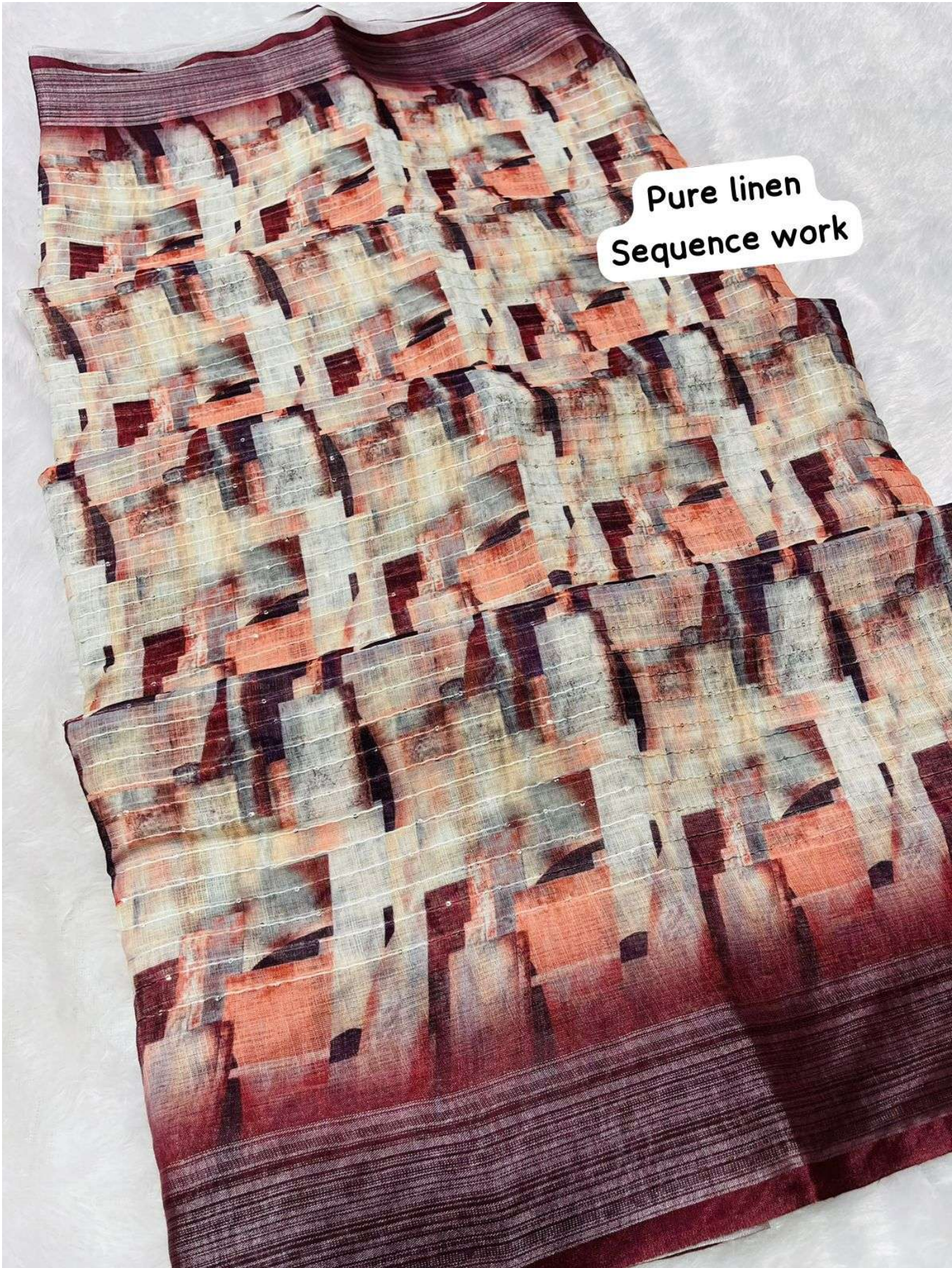
Pure linen Sequence work