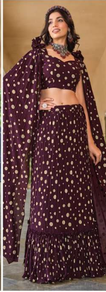
CODE | 2323