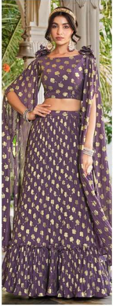
CODE | 2321