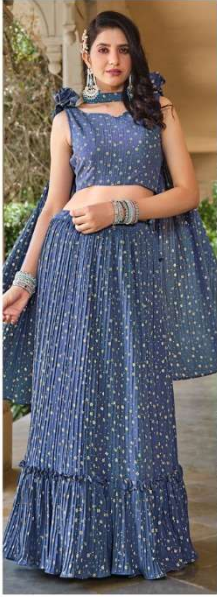
CODE | 2322