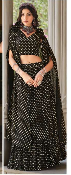
CODE | 2326