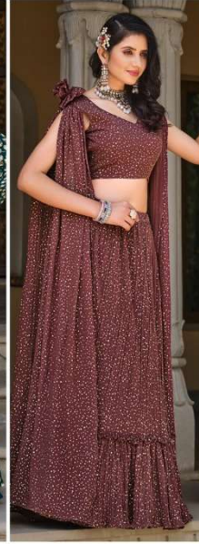
CODE | 2325