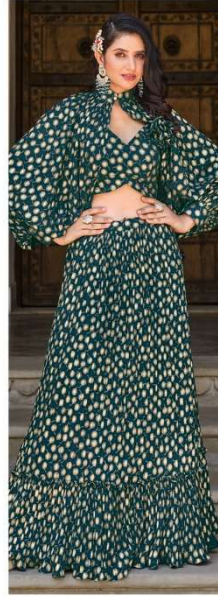
CODE | 2324