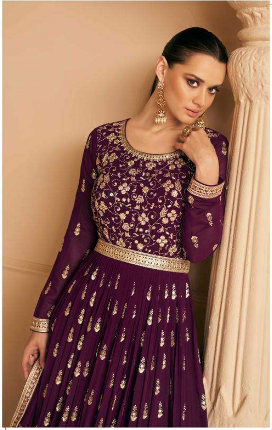
A - 9655