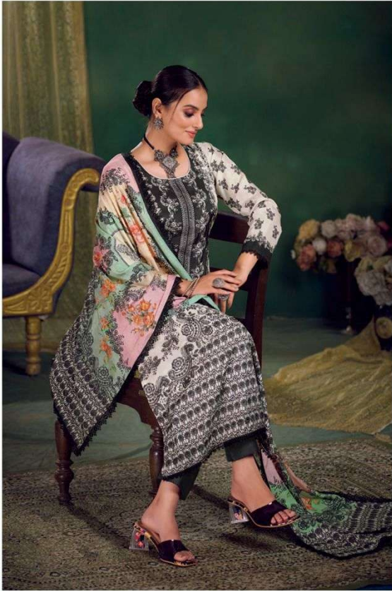
TREND Valour Cocktail glamour gate on ethnic edge