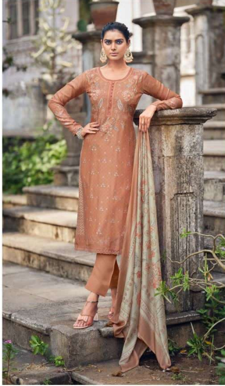
FASHION STYLING 10377