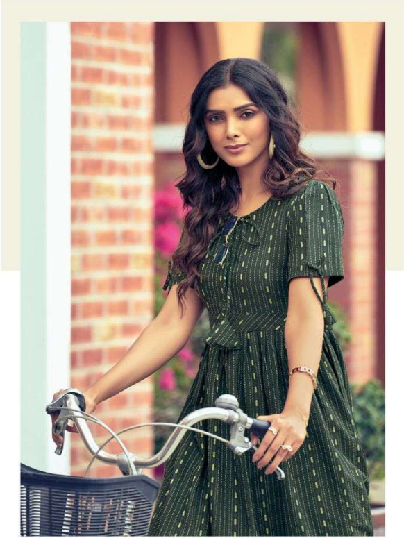
When a person is in fashion, all they do is right.