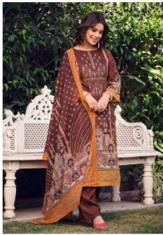
• 781-005 •