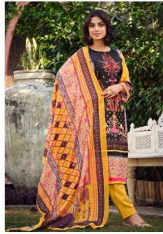
• 781-002 •