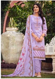
• 781-001 •