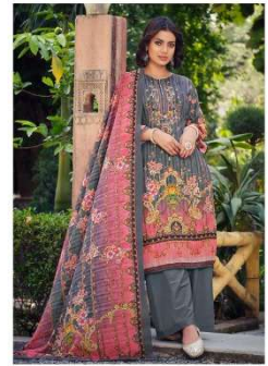
• 781-008 •