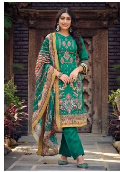
• 781-007 •