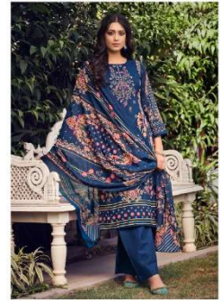
• 781-004 •