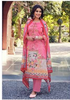
• 781-006 •