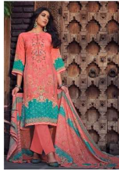
• 781-003 •