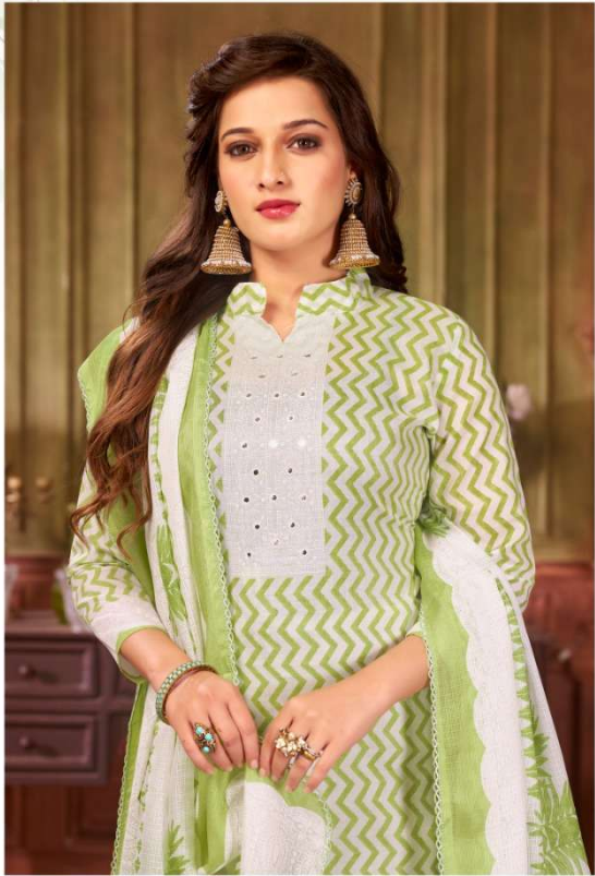
TOP :- PURE COTTON PRINT WITH KHATLI HAND WORK BOTTOM :- PURE COTTON SOLID DYED DUPATTA :- PURE COTTON KOTA CHEX PRINT