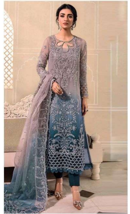
C -1349 C