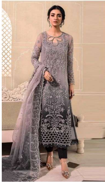
C -1349 B