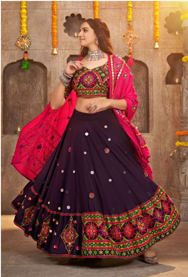
Fashioning You! 2339