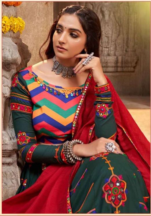
Smart sense of fashion