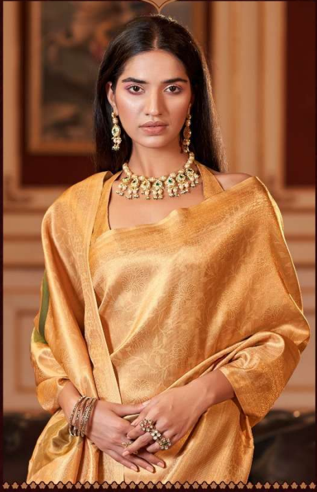
Golden Saree Have a look at the details of the saree