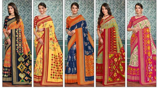
70723 SENTOSA SILK (Exclusive Fall)