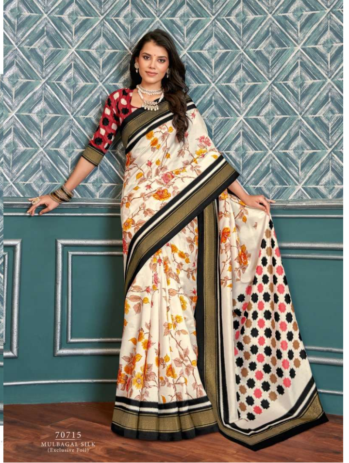
70715 MULBAGAE SILK (Exclusive Foli)