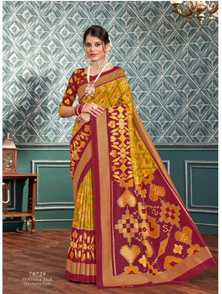
70729 SENTOSA SILK (Exclusive Foil)