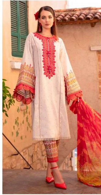
TAJ || 143

Taj CREATIONS MARIAB. PRINTS SUPER HIT-2