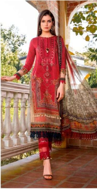
TAJ || 102