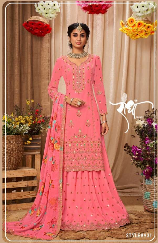
Sparks of beauty and tradition glow out from this beautiful apparel