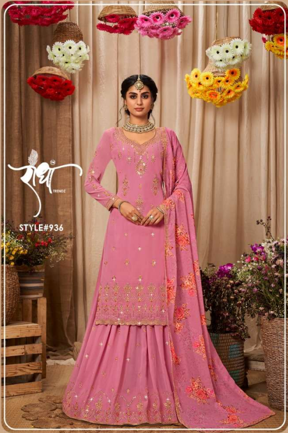
paired when floral designs best combination for beautiful girls and there for the festive season