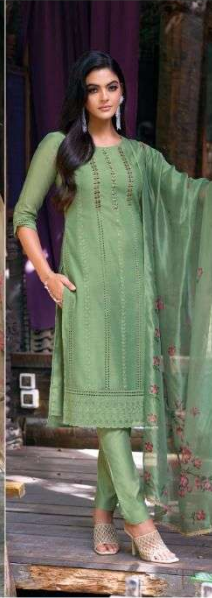
●●● LUCKNOWI : 13403