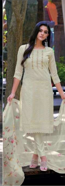
●●● LUCKNOWI : 13405