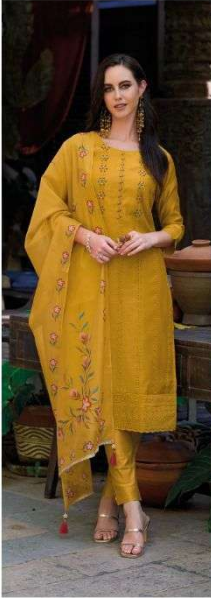
●●● LUCKNOWI : 13401