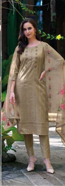
●●● LUCKNOWI : 13402