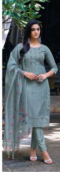
●●● LUCKNOWI : 13404