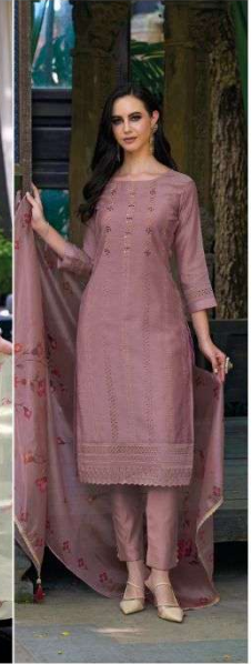
●●● LUCKNOWI : 13406