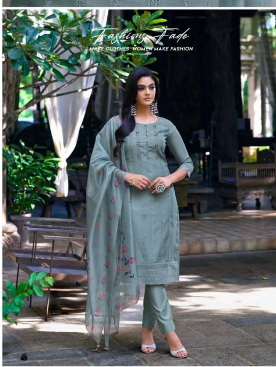
●●● LUCKNOWI : 13404