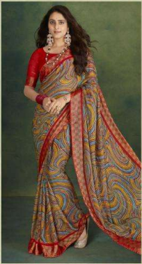
71016 (EXCLUSIVE FOIL)