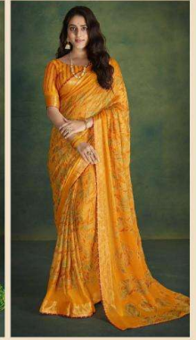
71015 (EXCLUSIVE FOIL)