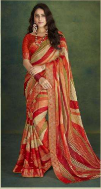
71010 (EXCLUSIVE FOIL)