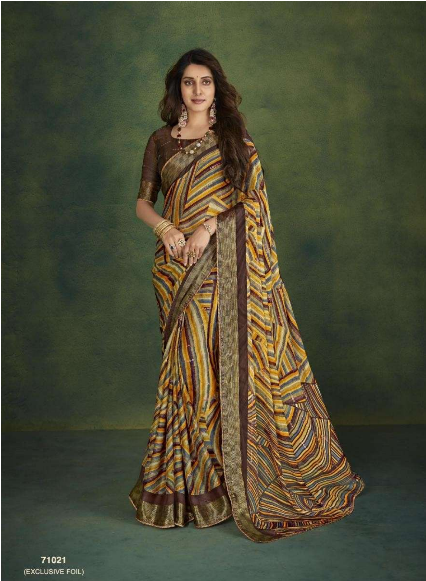
71021 (EXCLUSIVE FOIL)