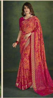
71020 (EXCLUSIVE FOIL)