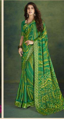
71014 (EXCLUSIVE FOIL)