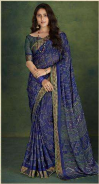
71017 (EXCLUSIVE FOIL)