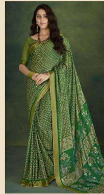
71019 (EXCLUSIVE FOIL)