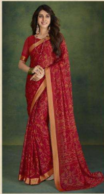
71018 (EXCLUSIVE FOIL)