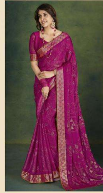
71013 (EXCLUSIVE FOIL)