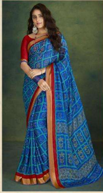
71012 (EXCLUSIVE FOIL)