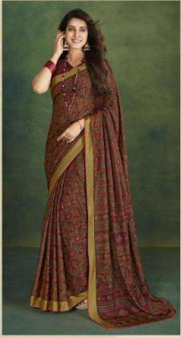
71011 (EXCLUSIVE FOIL)