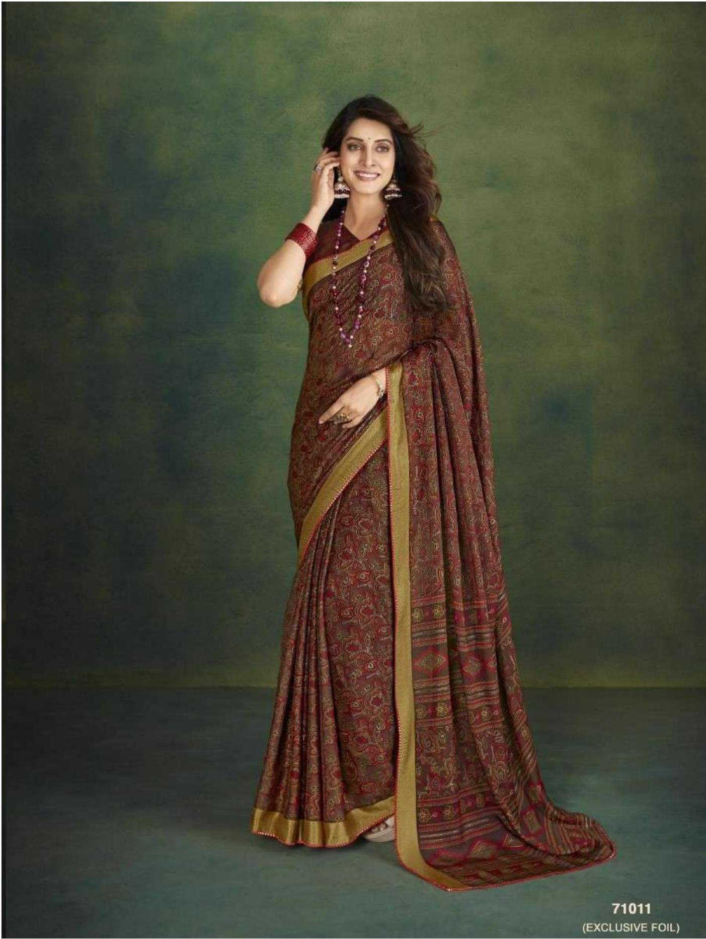
71011 (EXCLUSIVE FOIL)