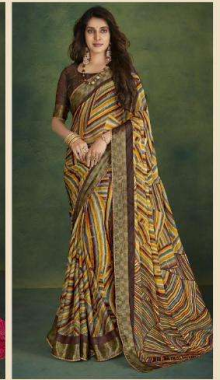
71021 (EXCLUSIVE FOIL)