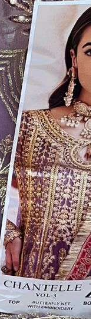
CHANTELLE VOL. 3 TOP BUTTERFLY NET WITH EMBROIDERY