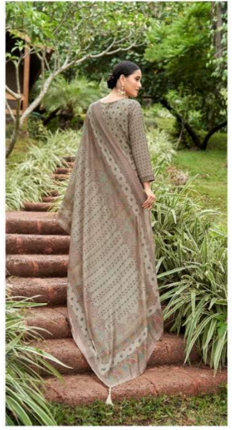
RENDERED BY ANI DILLI IN A TONE OF GREY WITH A SUBTLE PATTERN OF FLOWERS AND LEAVES. THE SARI IS MADE OF SILK AND IS A PART OF THE BLOSSOM COLLECTION.