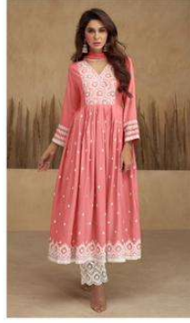
❖ 1107-L ❖