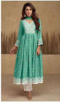
❖ 1107-M ❖