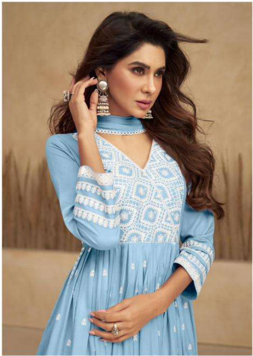
❖ 1107-N ❖