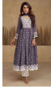
❖ 1107-O ❖