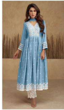
❖ 1107-N ❖