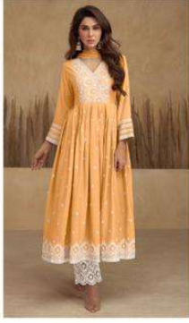
❖ 1107-K ❖