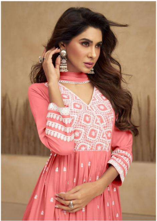
❖ 1107-L ❖