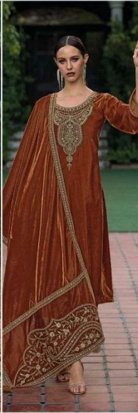
TZ - 2003