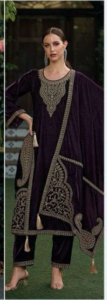
TZ - 2006