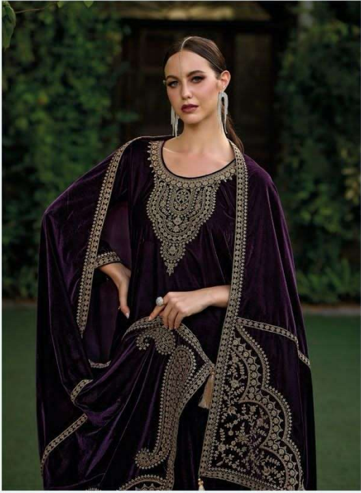
My dreams are made of fabric.