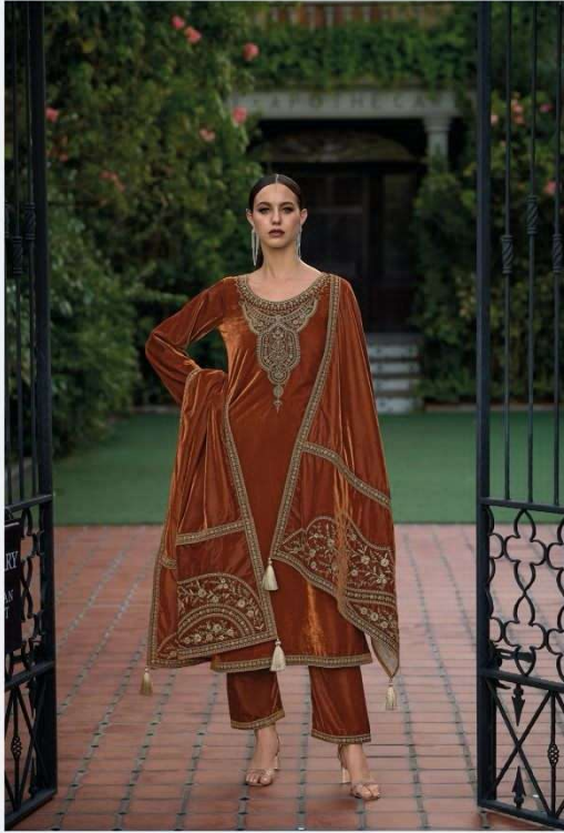
Sensuality begets aesthetics