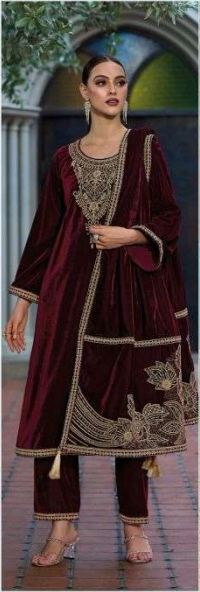
TZ - 2001