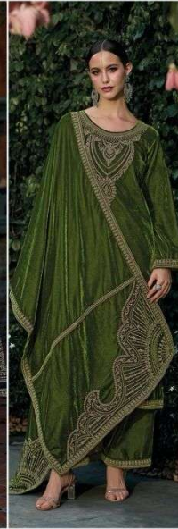
TZ - 2005