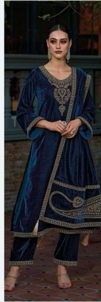
TZ - 2004