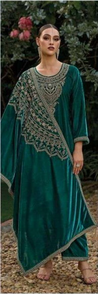
TZ - 2002