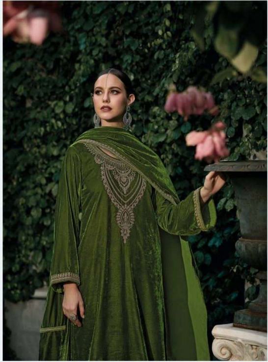
Elegant, dashing, and daring