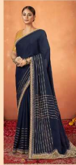
..... 43418 .....