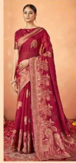
..... 43415 .....