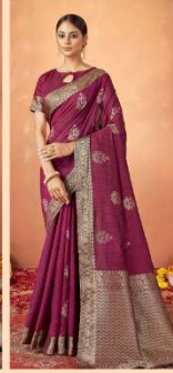
..... 43417 .....