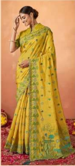
..... 43412 .....