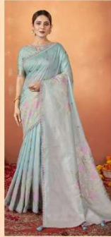
..... 43414 .....