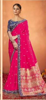
..... 43419 .....