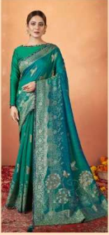
..... 43407 .....