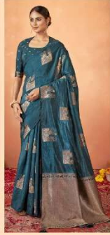
..... 43410 .....