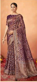
..... 43408 .....