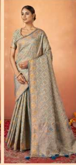
..... 43416 .....