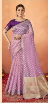
..... 43413 .....