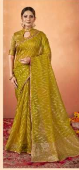
..... 43409 .....