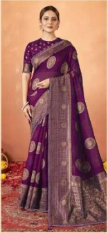
..... 43411 .....