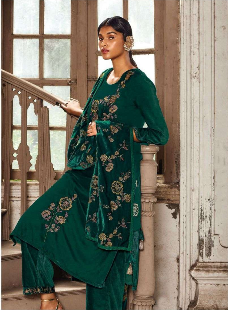
Ganga Fashions presents Samaa When you are in wait for someone special, standing in your balcony with a flower in hand makes you the best in this world. from top to down your combination with this lehnga is a beautiful day for someone.