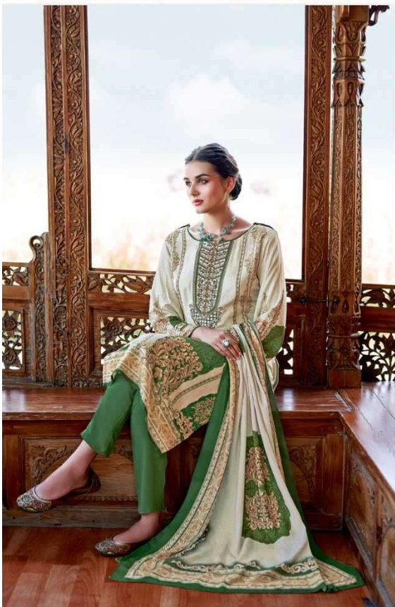
Nourishing unbelievable Crafts with freshness in styling for Perfect charming appearance of you. This splendid piece of fusion, perfectly immaculate your personality.