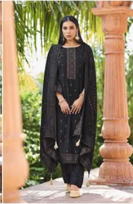
// 10556 //