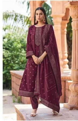
// 10561 //