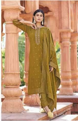
// 10555 //