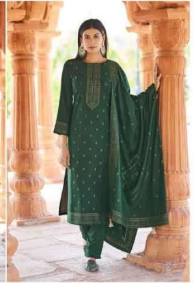
// 10560 //