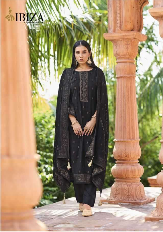
CLOTHES BRIGHTEN YOU TO THE EXTENT YOU DESERVE. // 10559 //