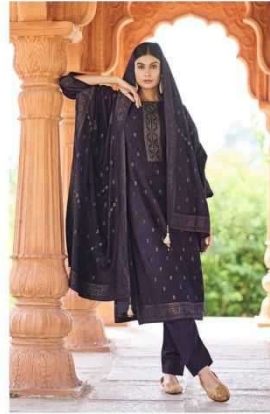
// 10559 //