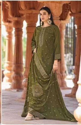
// 10558 //