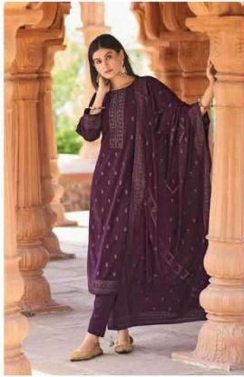
// 10557 //