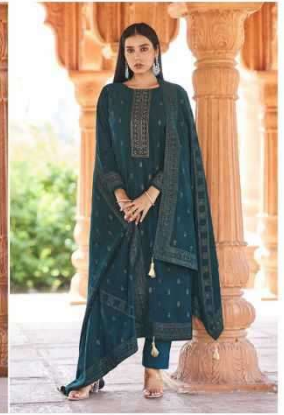
// 10562 //