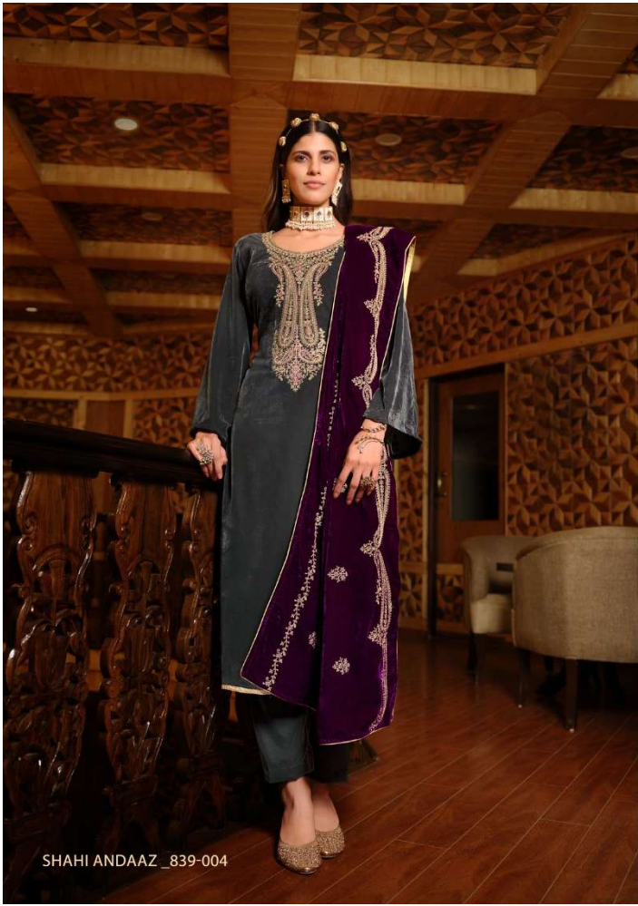
SHAHI ANDAAZ _ 839-004