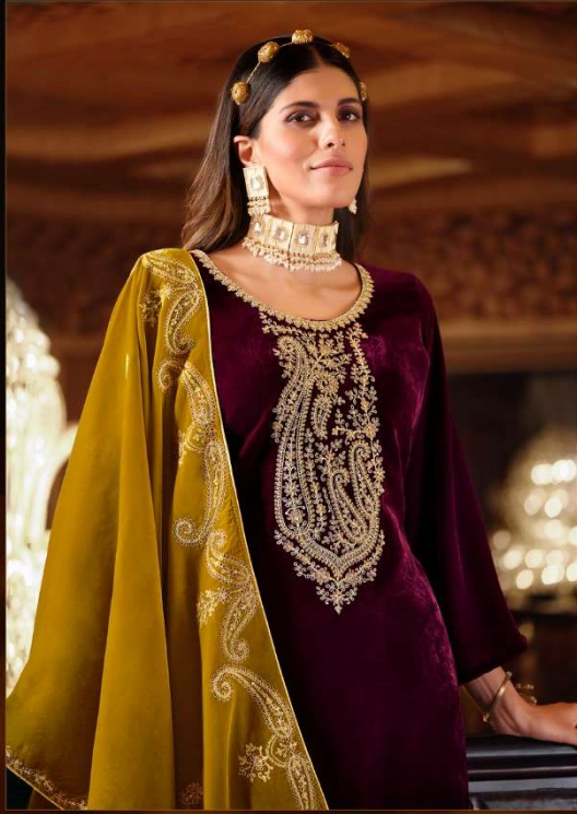
SHAHI ANDAAZ _839-002