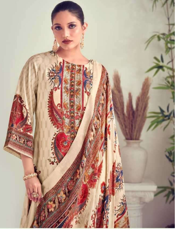
LOOK | 1505