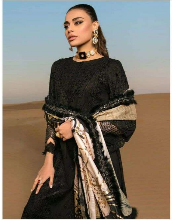
D.NO.154 TOP:-REYON COTTON BOTTOM:-PC COTTON DUPATTA:-TEBI SILK