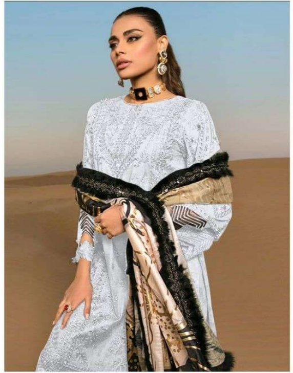
D.NO.154-A TOP:-REYON COTTON BOTTOM:-PC COTTON DUPATTA:-TEBI SILK