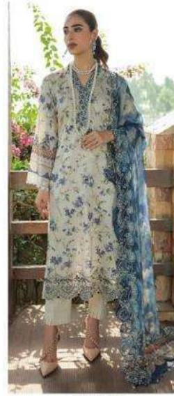
DESIGN NO. 1718