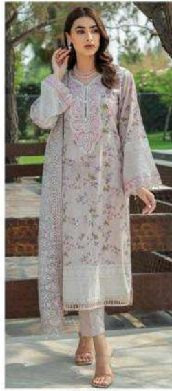
DESIGN NO. 1712