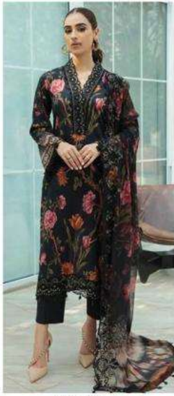
DESIGN NO. 1711