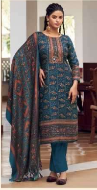
“ 855-006 ”