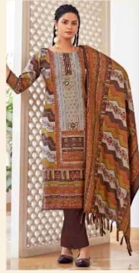
“ 855-008 ”