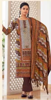
“ 855-008 ”