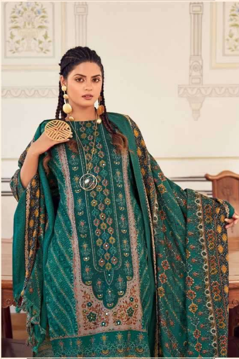
“ VINTAGE-INSPIRED LACE DRESS 855-003 ”