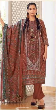
“ 855-005 ”