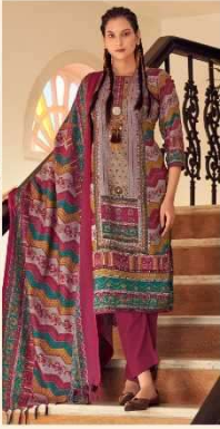
“ 855-002 ”