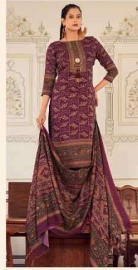
“ 855-004 ”