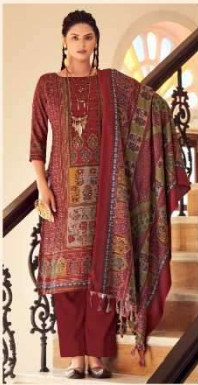
“ 855-007 ”