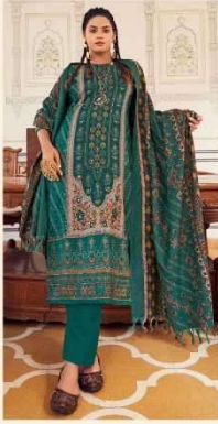
“ 855-003 ”