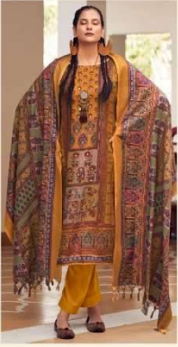
“ 855-001 ”