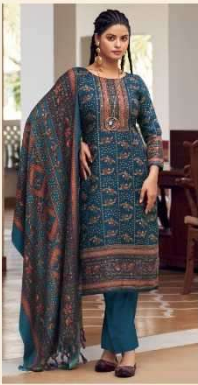
“ 855-006 ”