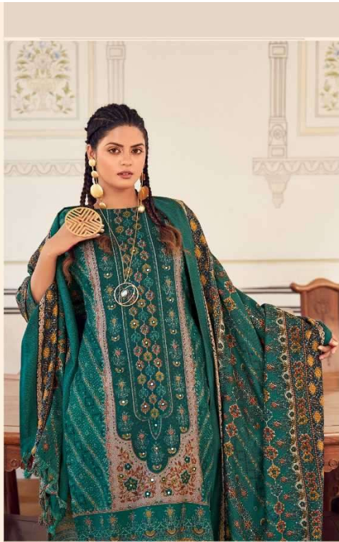
“ VINTAGE-INSPIRED LACE DRESS 855-003 ”