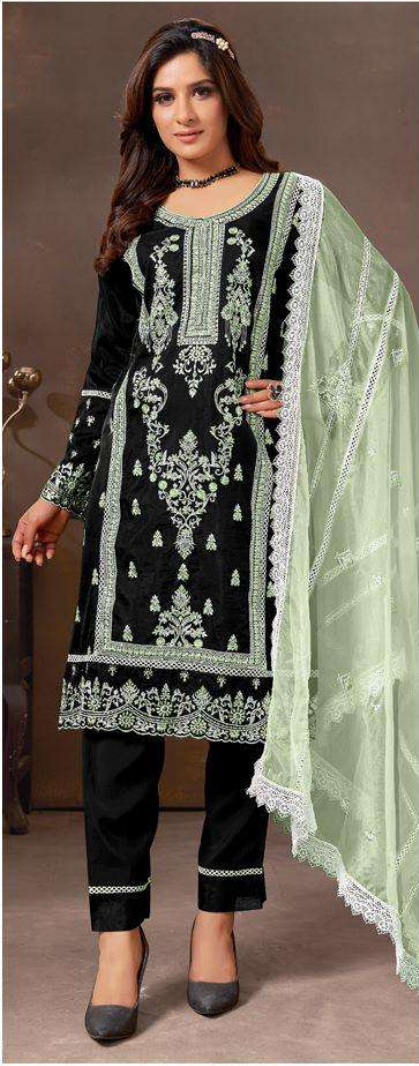
C - 1617 A