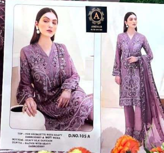
TOP - FOX GEOMETRICAL WITH HEAVY EMBROIDERY & MOTO WORK BOTTOM - HEAVY SILK FANTOON DUPPTA - NAJING WITH HEAVY EMBROIDERY D.NO.105 A